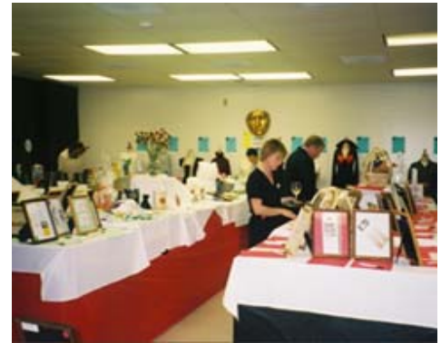
Masquerade Ball, Silent Auction