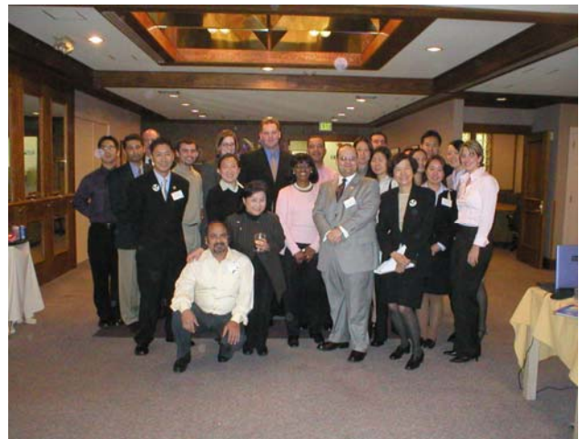
Hospitality Management Alumni Chapter '04